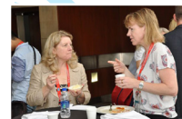
Discussions at the 22 nd Cochrane Colloquium

Can analysis of the effect of social disadvantage on health outcomes be improved through the use of causal pathways?